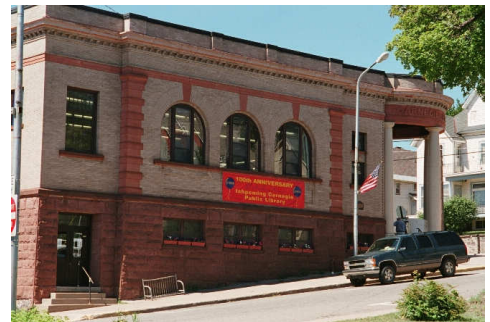
Ishpeming Carnegie Library

The library has a great selection of gardening and do-it-yourself resources, so as you begin your spring projects, please feel free to stop by or visit the library’s website for resources and helpful tips.